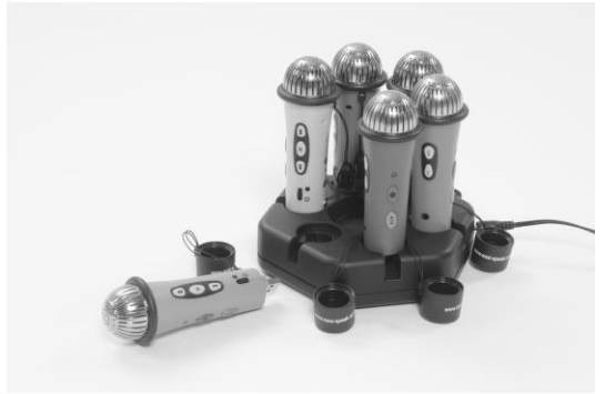
Please Read All Instructions Carefully Before Using

CHOKING HAZARD – Small parts. Not for Children under 3 years.