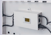
Built-in power management system with energy saving 24hr programmable timer