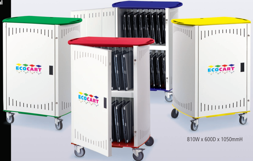
810W x 600D x 1050mmH