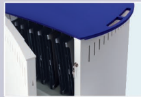
Stores & Charges up to 16 laptops from a single mains socket