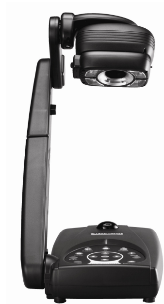
Adjustable Camera Rotation