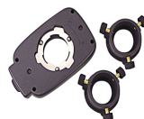
Microscope Adapter & Coupler