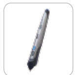
AP20 interactive pen