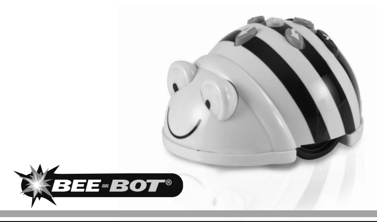
Primary ICT Ltd - www.primaryict.co.uk