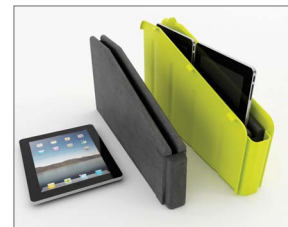
iPad converter kit for LapCabby Minis