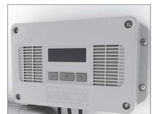
Power7 Energy Management System