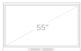
SMART Board 6055

Writing is natural and looks better with SMART ink. Whether you're using a pen or finger, each stroke is a work of art. Its realistic digital ink improves legibility, so teachers don't have to re-write and students feel confident contributing.