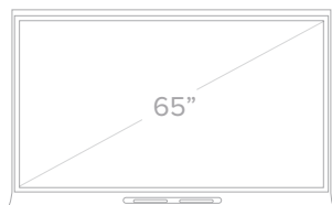
SMART Board 6065